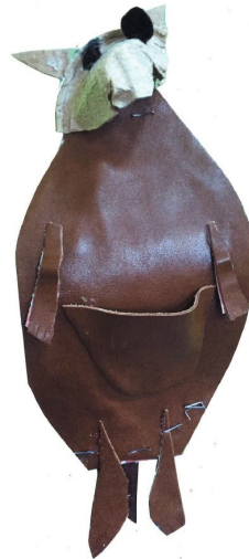
Keeping On Kangaroo